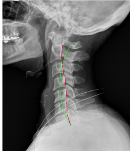
2: Side View of Your Neck on 1/2/2019